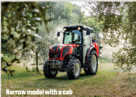
Narrow model with a cab