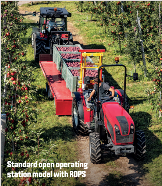
Standard open operating station model with ROPS