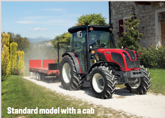
Standard model with a cab