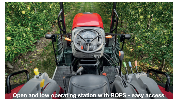
Open and low operating station with ROPS - easy access