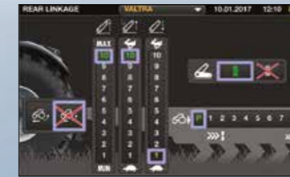
Intuitive way to set up settings with large controls and easy to understand functions.