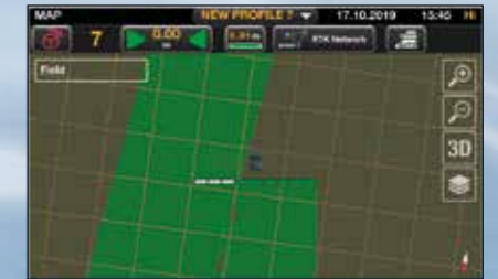
Use Section Control for maximal efficiency and minimal overlap.

Valtra offers a set of smart farming technologies that work seamlessly together – Valtra Guide, ISOBUS, Section Control, Variable Rate Control and TaskDoc – which you operate from the SmartTouch terminal. By automatically guiding your tractor and implements, these improve your accuracy and precision, reduce working time, and make sure you get the better yields and better return on your investment.