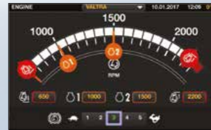
Logical to set up settings with swipe gestures. All settings are automatically stored in memory.