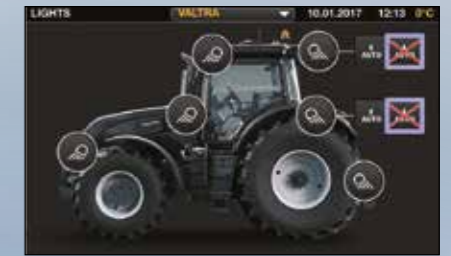
Easy configuration of worklights from the terminal. Worklights on/off switch in the armrest with beacon on/off switch.