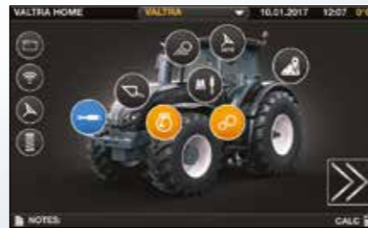
Easy to navigate menu structure.