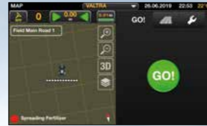
Control Valtra Guide using SmartTouch.