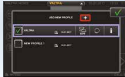
Profiles for operators and implements which can be easily changed from any screen menu. All the setting changes will be saved in the selected profile.